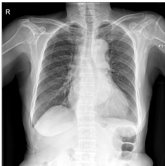
Figure 1. Chest radiograph: mild mediastinal widening with no active lung lesions.